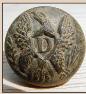
U.S. Dragoon (circa 1840s-1850s)