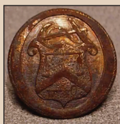
U.S. Dept. of Treasury (1-piece)