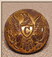
U.S. Cavalry (2-piece)