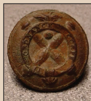
U.S. Ordnance (2-piece)