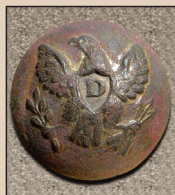
U.S. Dragoon (1-piece)