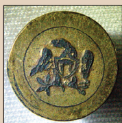
U.S. Topographical Engineer's button, coin type, from Virginia.