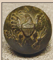
U.S. General Service