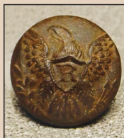
U.S. Rifleman (2-piece)