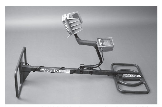
The fully assembled GTI 2500 and Treasure Hound Depth Multiplier.