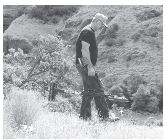
The TreasureHound Depth Multiplier should be carried with the forward coil facing down. Do not swing your detector back and forth as you would with a standard searchcoil.