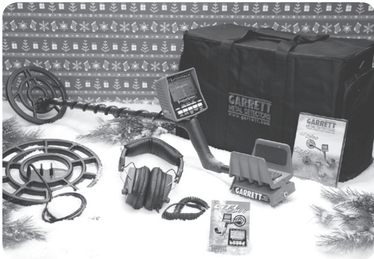
Regular price of detector and accessories if purchased separately is $1,479.80.

Choose from two holiday specials of bonus accessories and big savings!