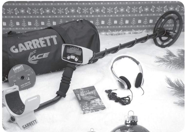
Regular price of detector and accessories if purchased separately is $218.80.

Don't miss these savings! Contact us today!