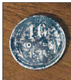
Finder: Aleksey N., Russia Using: ACE 250 Find: 1927 Russian silver 10 Kopeks coin, USSR