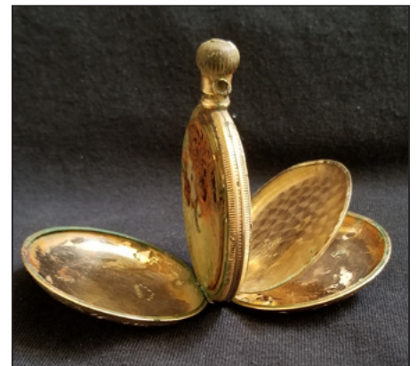
Finder: Wesley C., Texas Using: AT Pro Find: Gold plated pocket watch