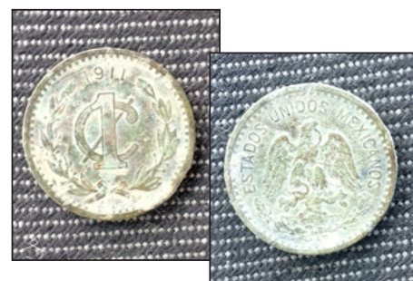
Finder: Julio V., Mexico Using: ACE 300i Find: 1911 Mexican brass one centavo coin