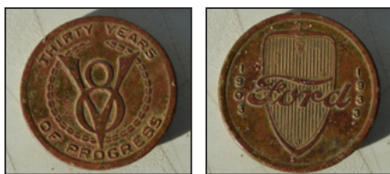
Finder: Art W., Idaho Using: AT Pro Find: 30th Anniversary medallion/token from car manufacturer Ford