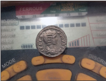
Finder: Elena, Europe Using: ACE 300i Find: Silver denarius of Julia Domna, wife of Septimius Severus 193-217AD