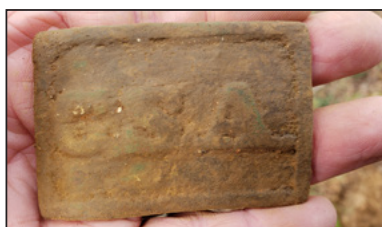
Finder: Jeremy S., Alabama Using: AT Pro Find: Confederate C.S.A. belt plate