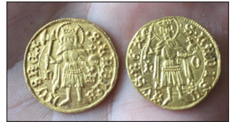
Finder: George-Ovidiu A., Europe Using: ACE 400i Find: 15th century gold florin coin