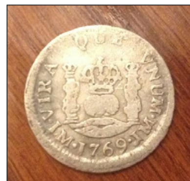
Finder: Evan C., Europe Using: ACE 400i Find: 1769 silver Spanish 1/2 reale