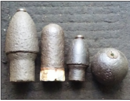
Finder: Jon L., Virginia Using: AT Pro Find: Civil War artillery shells discovered at a skirmish site outside of Richmond, Virginia.