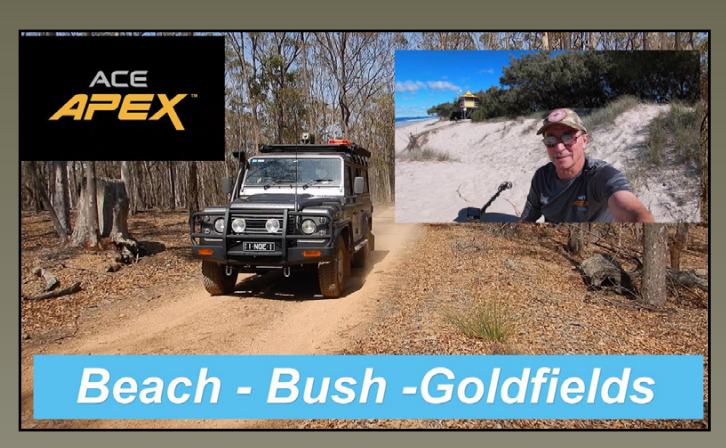
NQ Explorers test out the ACE Apex multi-frequency detector traveling more than 500km in three days from the salt water beaches of the Gold Coast to the highly mineralized goldfields of Queensland, Australia.