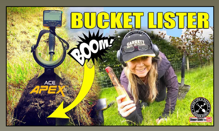
England's DiggerDawn discovers a bucket lister silver coin with the ACE Apex after detecting for over five years.

Click on any image to view the YouTube video.