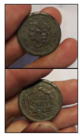
Finder: Sam S., Ohio Using: ACE 400