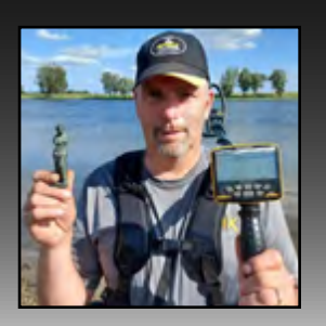
Shown are a few recent submissions. Send in your Apex Top Finds to be featured in the next Garrett Searcher!