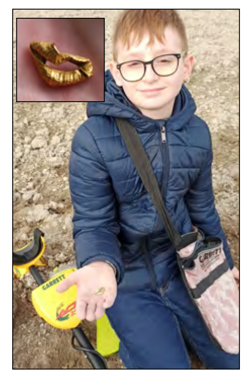
Finder: Louen S., Europe Using: ACE 250