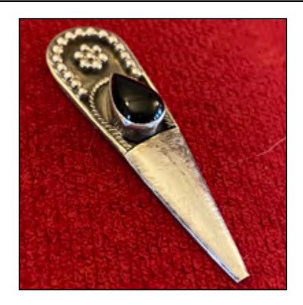
Finder: Ewen R., Connecticut