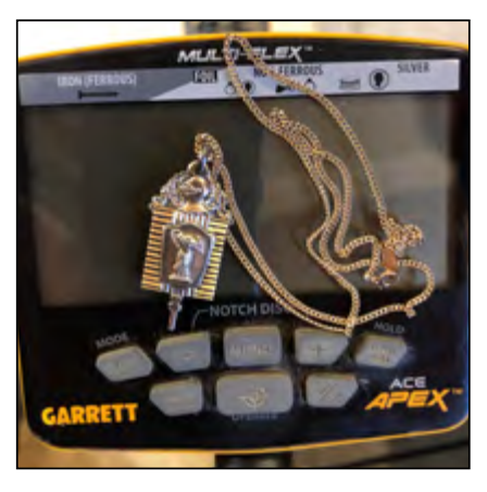
Finder: Renee C., New York