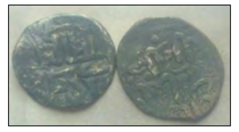
Finder: Nikolay S., Russia Using: ACE 350

Find: 1801 silver 8 reale, a 1922-37 East African 10 cent, a 1922 Singapore penny, and three rings: gold, copper and silver