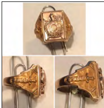
Finder: Mark R., Ohio Using: AT Pro Find: 10k gold Demolay ring