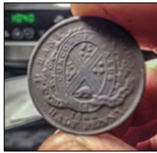
Finder: Allan L., Canada Using: AT Pro International Find: 1844 Canadian half penny