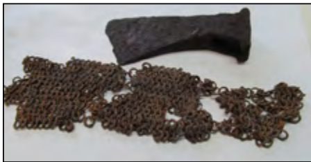
Finder: Miroslav S., Europe Using: AT Pro International Find: Medieval chain mail and axe head found in front of a castle