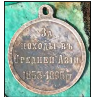
Finder: Pavel P., Russia Using: AT Pro International Find: Central Asia silver campaign medal/award