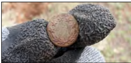
Finder: Heriberto H., Mexico Using: AT Pro International Find: 1940s military button