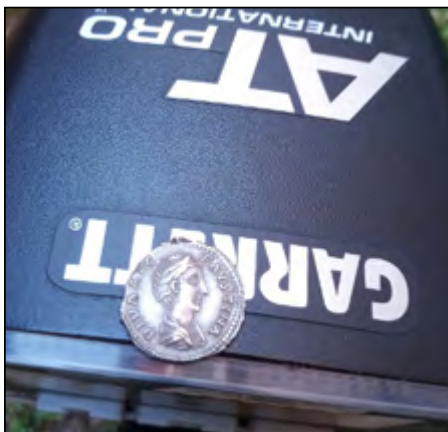
Finder: Valentin S., Europe Using: AT Pro International Find: Silver Roman denarius