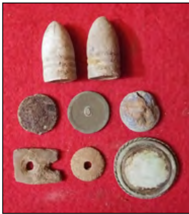
Finder: Jon L., Virginia Using: AT Pro Find: Civil War relics found from a "hunted out" site