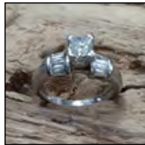
Finder: Eddie V., California Using: AT Pro Find: Platinum ring with 1 carat diamond, appraised at $4,000 - $5,000