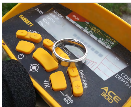
Finder: Jacob G., Michigan Using: ACE 300 Find: Men's stainless steel wedding ring