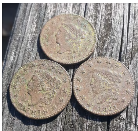
Finder: Heriberto C., Connecticut Using: AT Gold Find: Three early 1800s large cents