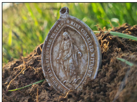
Finder: Craig K., Europe Using: ACE 250 Find: Silver Virgin Mary religious medallion