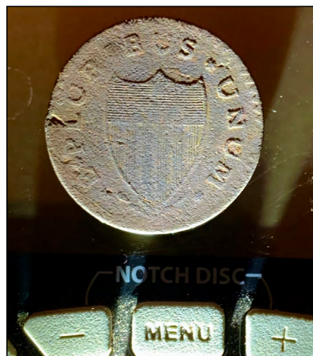
Finder: Bill E., New Hampshire Using: ACE Apex Find: 1788 New Jersey colonial copper coin