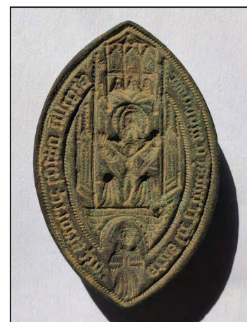
Finder: Matthew C., Europe Using: AT Pro International Find: Significant vesica shaped Priory seal matrix