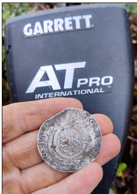
Finder: Jan L., Europe Using: AT Pro Find: 1769 silver Danmark, 1 speciedaler coin