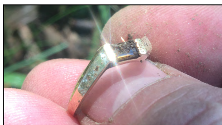
Finder: Ken C., Massachusetts Using: ACE Apex Find: 14k gold ring with emerald cut yellow diamond