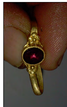
Finder: Patryk S., Europe Using: AT Pro International Find: Small antique gold ring