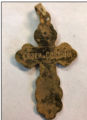
Finder: Bill W., Using: ACE 300 Find: Gold plated Russian Orthodox cross