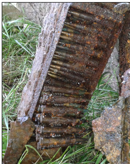
Finder: Henk B., Europe Using: EuroACE Find: Box full of WWII bullets