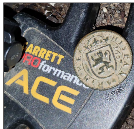
Finder: Francisco R., Europe Using: ACE 250 Find: 1607 Philip III Spanish bronze 4 maravedís coin