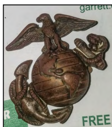
Finder: Ralph D., Tennessee Using: ACE Apex Find: U.S.M.C. pin