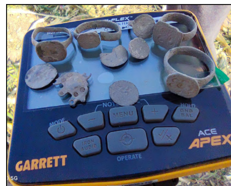
Finder: Andrei B., Europe Using: ACE Apex Find: 14th century Ottoman coins and rings