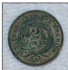
Finder: Ron R., Vermont Using: AT Pro Find: 1866 copper two cent piece